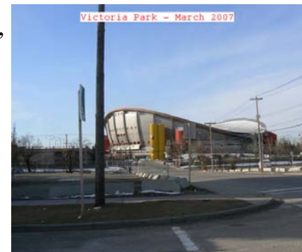
Calgary Drop-In & Rehab Centre—2007

In the last 18 months, all the remaining rooms in Victoria Park have been removed to make room for Stampede Expansion